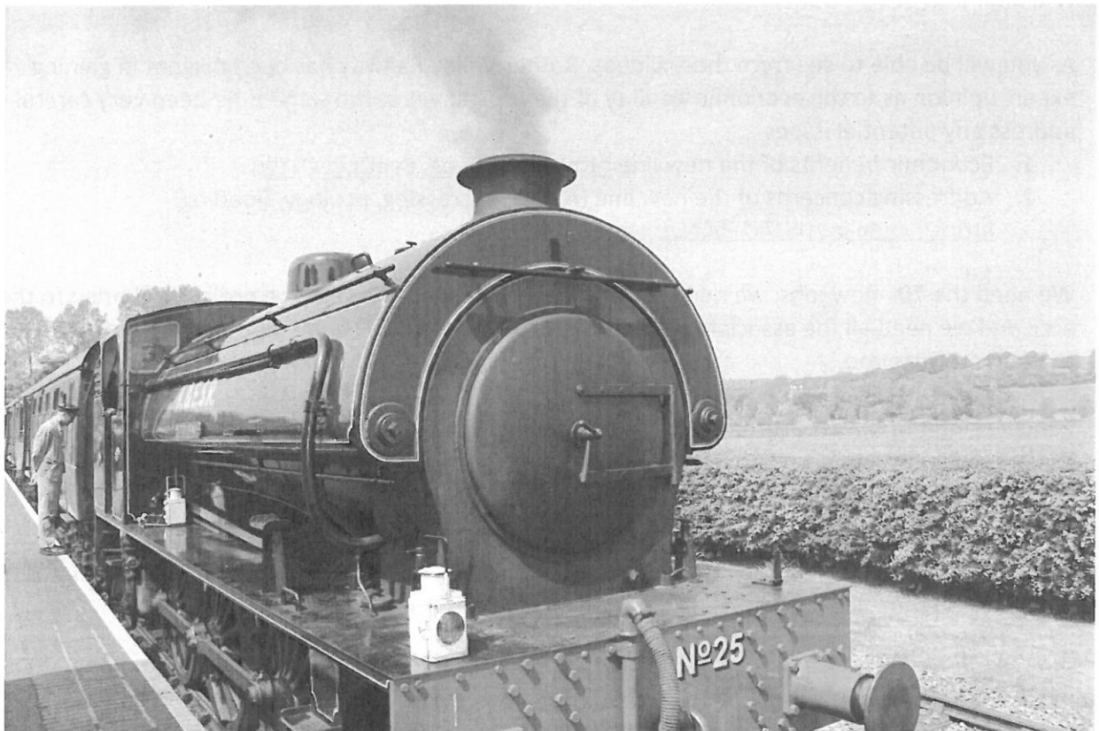
Kent & East Sussex Railway steam train at Bodiam Station awaiting departure to Tenterden