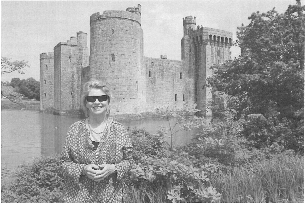
Bodiam Castle - every child's dream of what a real castle looks like